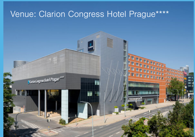
Venue: Clarion Congress Hotel Prague****

The ETCC 2026 will take place at the Clarion Congress Hotel Prague , a modern and fully equipped venue offering a perfect setting for an international scientific and industry event. Located in the heart of Prague, the hotel provides excellent accessibility and comfortable accommodation. The venue is well-connected to public transportation, allowing attendees to explore Prague's rich cultural heritage.